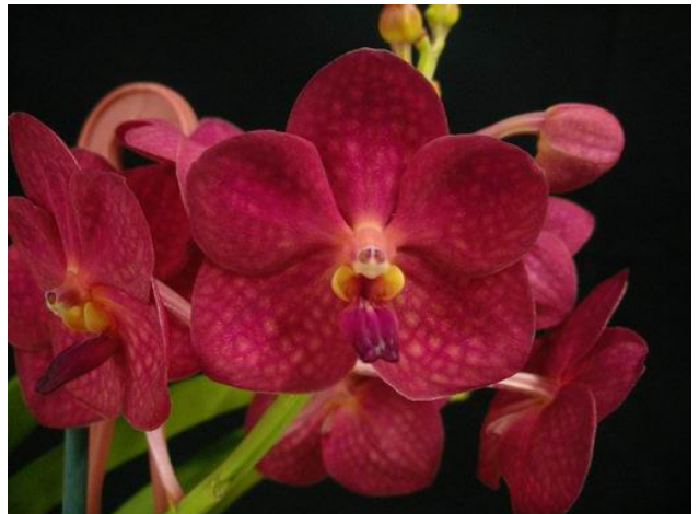
Ascda. Suk Samran Beauty