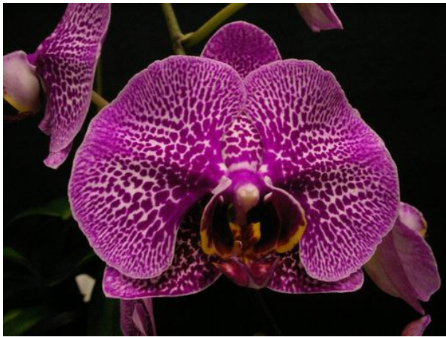
Dtps. Leopard Prince x sib