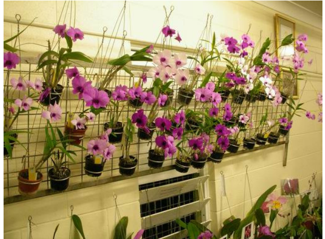
Flowering dendrobiums for sale