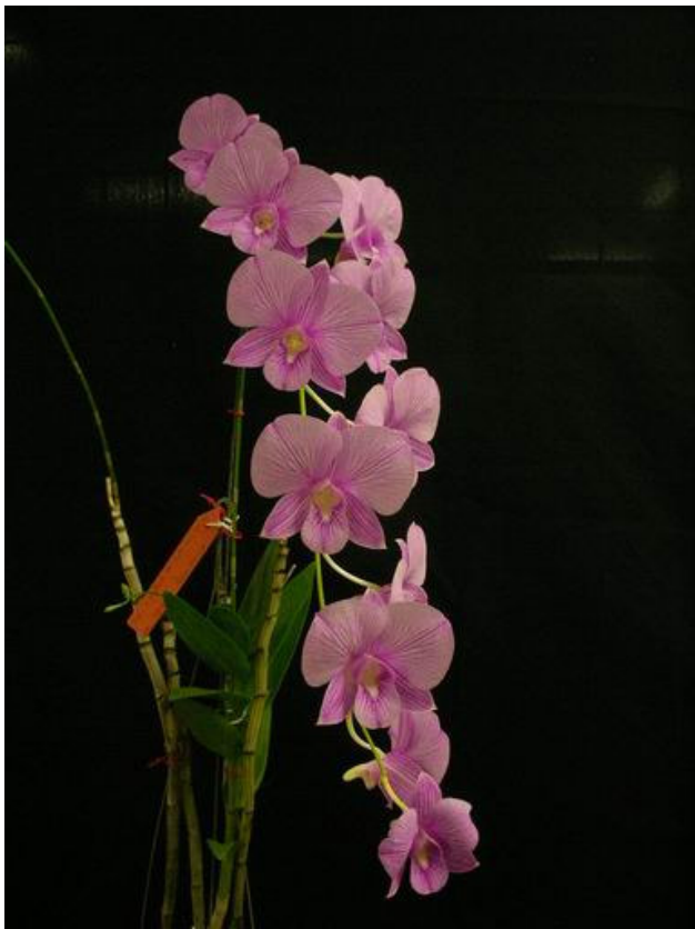
Dendrobium bigibbum var. superbum 'Stripe' x Dendrobium bigibbum 'Tozer Stripe'