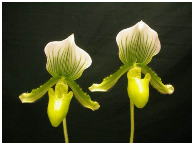
Paphiopedilum maudiae var. alba