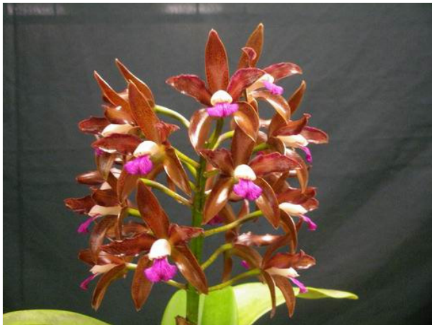
Ctt. Chocolate Batt 'Ingham' HCC/AOC