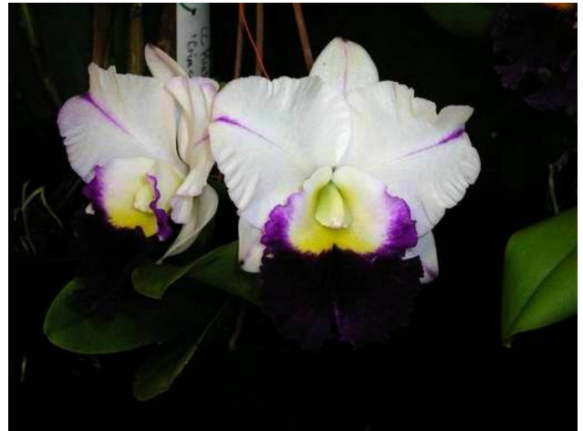
Blc. Mem. Anna Balmores 'Convex'