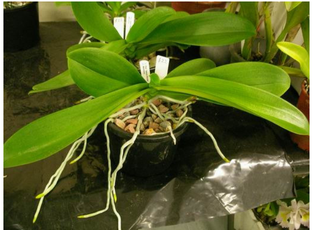
Well grown phalaenopsis also for sale. Ones like this will be for sale at the TQOC Conference and Show.