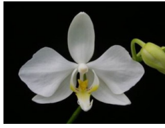
Phalaneopsis amabilis var. rosenstromii