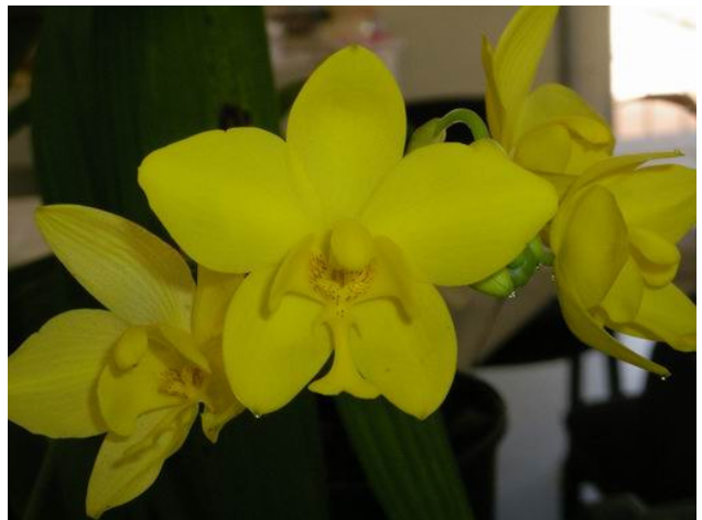
Spa. Lion of Singapore