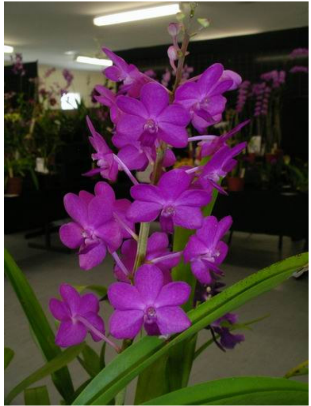
Vasco. Precious 'Chao Praya Fuchs'

Ready for the roof. This is the progress made as of Friday 21 st May.