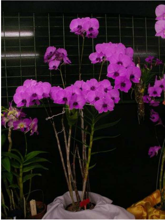
Dendrobium bigibbum var. superbum